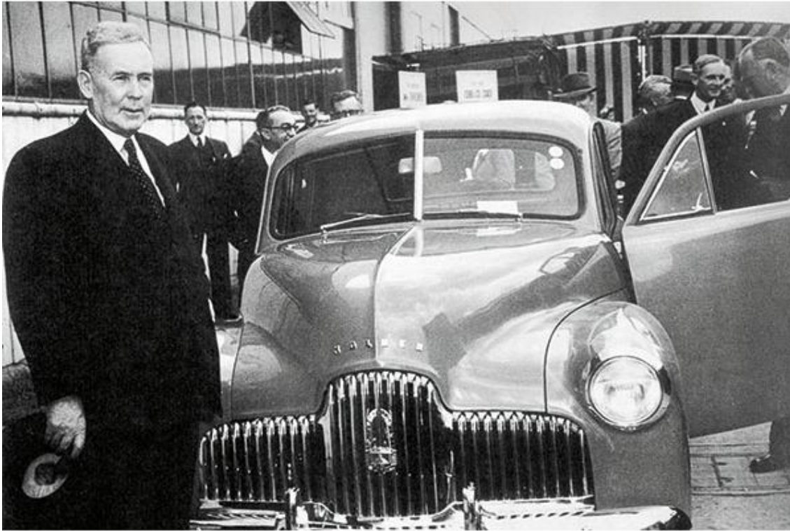
Prime Minister Ben Chifley launches the 48-215 Holden at Fishermans Bend.

Our members bus and walking tour of Fishermans Bend will take place on Sunday 3 March from 10:00am to 1:00pm.